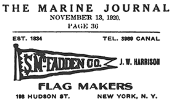
Figure 9. The company advertisement as of November 1920. Source: The Marine Journal, 13 November 1920, 36.