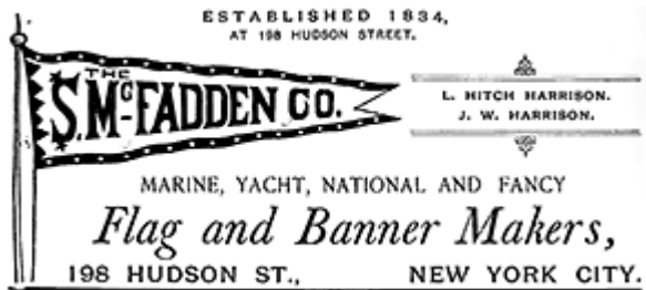
Figure 8. The business advertisement under new management in 1893. Source: Races for the America's Cup ( New York: New York Tribune Association, 1893 ), 81.