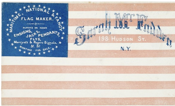
Figure 2. A McFadden flag “cover” issued during the period 1860 to 1863.