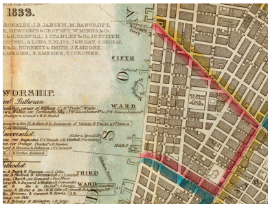
Figure appendix 2b. The 5th Ward, New York City, in 1833. Source: Detail of Hooker's New Pocket Plan of the City of New York Compiled & Surveyed by William Hooker, Engraver (New York, 1833).

Figure appendix 2a. In 1834, nos. 169 and 171 Hudson Street stood at the junction of Desbrosses Street on the left side of Hudson Street, meaning 172 stood on the right side of the street. Number 177 was the last on the left at the junction of Canal Street, which means 178 stood on the right-side corner. 60 By my estimate what later became number 198 was number 174 in 1834. The houses were renumbered in 1844. 61 Source: Thomas Longworth (ed.), Longworth's American Almanac, New-York Register, and City Directory (New York: Longworth, 1834), 15.