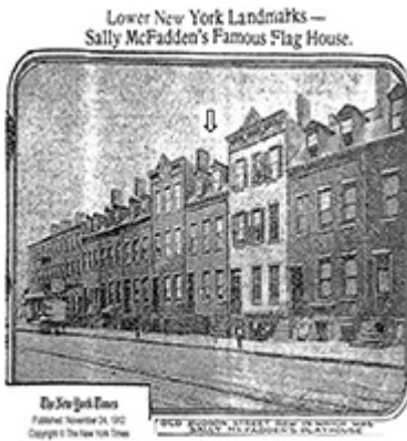
Figure appendix 2a. In 1834, nos. 169 and 171 Hudson Street stood at the junction of Desbrosses Street on the left side of Hudson Street, meaning 172 stood on the right side of the street. Number 177 was the last on the left at the junction of Canal Street, which means 178 stood on the right-side corner. 60 By my estimate what later became number 198 was number 174 in 1834. The houses were renumbered in 1844. 61 Source: Thomas Longworth (ed.), Longworth's American Almanac, New-York Register, and City Directory (New York: Longworth, 1834), 15.

No. 198 Hudson Street formerly stood opposite Desbrosses Street, a few doors below Canal Street, in what is today the Tribeca District of New York City. In the nineteenth and early twentieth centuries this area was designated as the 5th Ward, First Assembly District. The building was reportedly built in 1800. 59