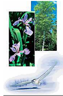
Figure 7. Québec’s tree, flower, and bird: the yellow birch, iris versicolor, and snowy owl.