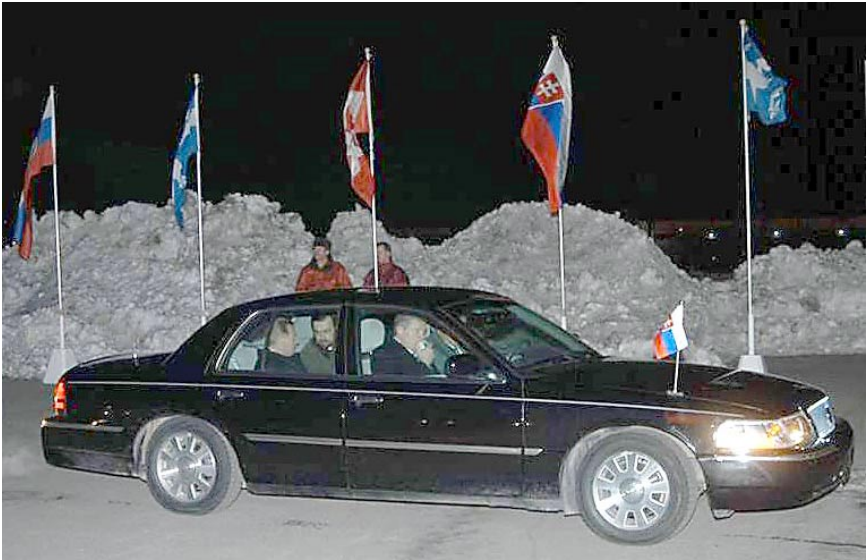
Figure 9. The flag of Slovakia on a limousine, flanked by the flags of Slovakia, Québec, and Canada.

The rest of our inventory consists of 8 x 12-inch pennants flown on limousines (Figure 9) used during official visits by heads of state, heads of government, and representatives of heads of state (ambassadors and high commissioners).