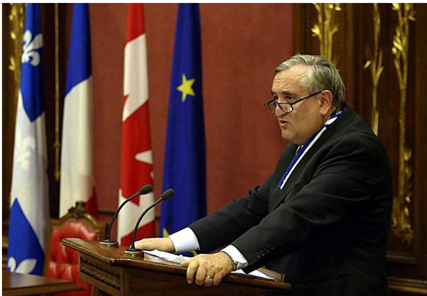
Figure 16. Québec / France / Canada / EU.

The use by the Government of Québec of a foreign national emblem is a courtesy extended to foreign dignitaries on official visits to Québec. This means that we decide how to use and position the flag of Québec and