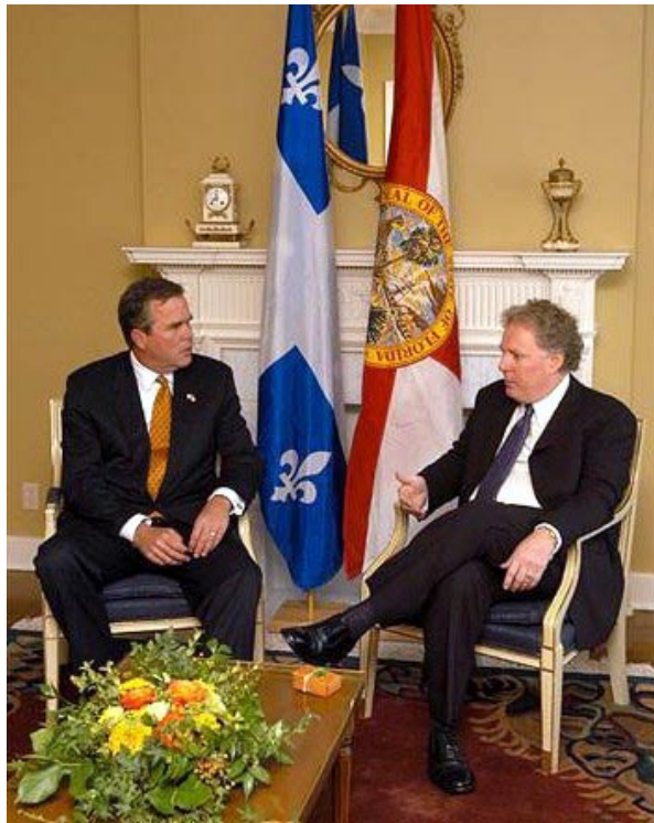
Figure 2. Florida's governor Jeb Bush meets with Québec's premier Jean Charest before the flags of Quèbec and Florida.

Le Protocole generally uses flags in fulfilling all but the first aspect of its mandate.