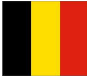
Figure 13. Belgium 13:15.