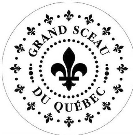
Figure 6. The seal of Québec.