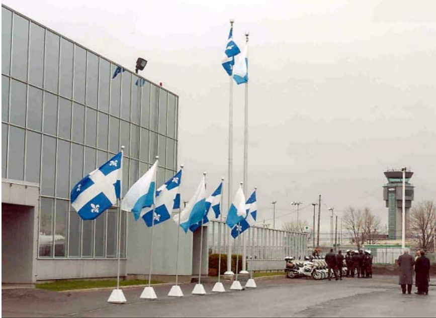
Figure 3. Alternating flags of Québec and Bavaria at Jean-Lesage International Airport in Québec.