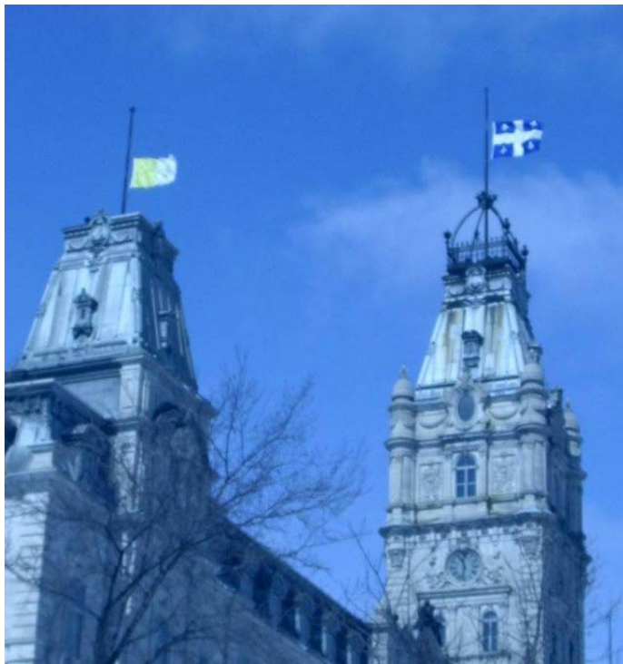
Figure 20. The flags of Vatican City and Québec at half-staff over the Parliament Building after the death of Pope John Paul II.

Following the death of the president of the Palestinian Authority, Yasser Arafat, we did not lower the Québec flag on the central tower of the Parliament Building to half staff, as we do on the day of the funeral of a current head of state. The Government of Québec decided to align itself with the federal position, as it does increasingly for half-staff displays. On the other hand, soon before a visit to Québec by Leila Shahid, the Palestinian Delegate General in France, whom I had the pleasure of accompanying, we raised the flag of Palestine above the Parliament Building. Ms. Shahid was deeply moved—particularly given that the very same day, in Québec City, she organized the transfer from Ramallah to Paris of her great friend Yasser Arafat, who was close to death.