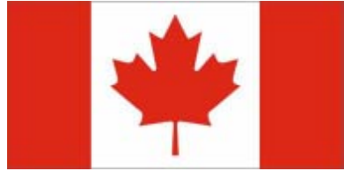
Figure 12. Canada 1:2.