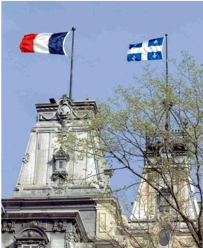
Figure 8. Québec's Parliament Building displaying the flags of France and Québec (during a visit by French Prime Minister Raffarin).

Le Protocol has about 3,000 flags (including about 100 in Montréal) to meet its needs for its own displays and for loans. Most are indoor flags measuring 3 x 6 feet or 4 x 6 feet. We also have an outdoor flag for each country (4 1/2 x 9 feet or 6 x 9 feet), to be raised over the Québec Parliament Building, seat of our national assembly (Figure 8). An 8 x 12-foot flag of Québec has been flown atop the central tower of the building since 1948.