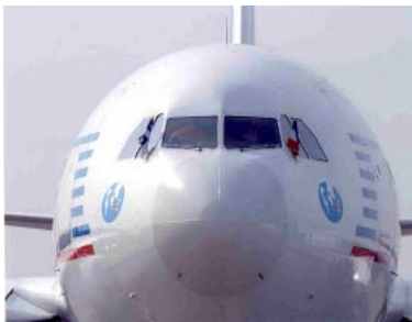
Figure 4. The flags of France and Québec displayed from the cockpit windows of a visiting jet.

However, despite decades of tradition, Le Protocole is no longer responsible for the flag of Québec itself. Since 1999, the Act Respecting the Flag and Emblems of Québec has governed the official use of the Québec flag. The Ministère de la Justice (Department of Justice) is responsible for administering this Act, as well as the Regulation Respecting the Flag of Québec . The Ministère du Conseil exécutif (the Premier's