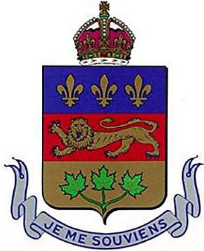
Figure 5. The arms of Québec.

The Act Respecting the flag and emblems of Québec defines Québec's official symbols, namely the flag, coat of arms, seal, and emblematic tree, flower, and bird—the yellow birch, iris versicolor , and snowy owl (Figures 5–7). (The lieutenant governor's personal flag is not one of our official emblems.)