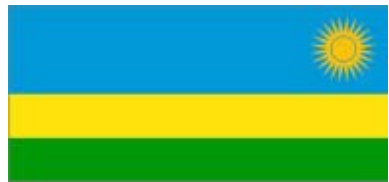
Figure 14. Rwanda 6:13.