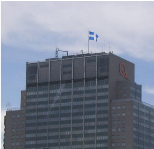
Figure 10. The 16' x 24' flag of Québec atop the Montréal headquarters of Hydro-Québec.

The rest of our inventory consists of 8 x 12-inch pennants flown on limousines (Figure 9) used during official visits by heads of state, heads of government, and representatives of heads of state (ambassadors and high commissioners).