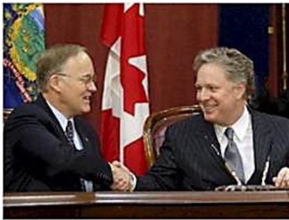
Figure 19. The Governor of Vermont and the Premier of Québec with only the flags of Vermont and Canada visible behind them.

A problem arises in flag display in the Parliament Building's Salon Rouge, which is used for a variety of Québec government ceremonies. Immediately after the current government was elected in April 2003, it decided that the flag of Canada must be displayed at all times in the Salon Rouge. Both Le Protocole and the protocol branch at the National Assembly branch have therefore had to incorporate the flag of