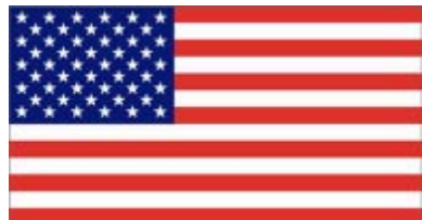
Figure 15. United States of America 10:19.