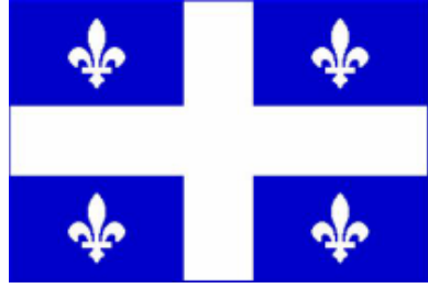
Figure 11. Québec 2:3.

The Government of Québec has established specific rules for using the flag of Québec. It is reasonable to assume that these rules are comparable to those in other countries and societies.