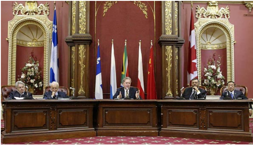
Figure 18. Displaying the flags of Québec and Canada in the National Assembly's Salon Rouge.