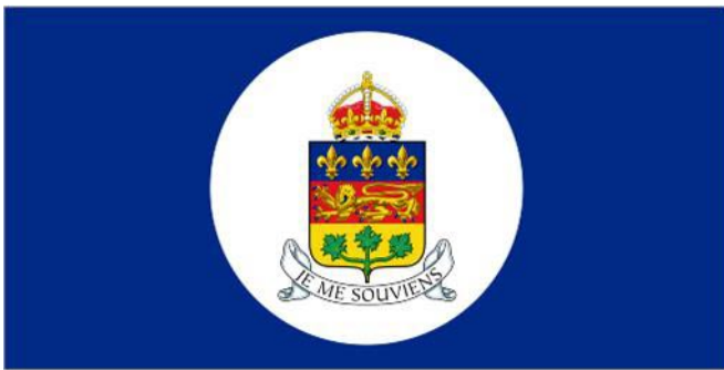
Figure 21. The personal flag of the lieutenant governor of Québec.

As the representative of the head of the Canadian state, the lieutenant governor flies her personal flag for all official activities, giving it precedence over the flag of Québec. Even though she is Québec's highest-ranking official, she sometimes performs her duties in the absence of the flag of Québec—a usage not authorized by the Act Respecting the Flag and Em-