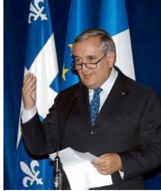
Figure 17. Québec / EU / France.

the foreign flag. As set forth in the Act Respecting the flag and emblems of Québec , the Québec flag has precedence in all cases, including alignments of flags and official ceremonies. This applies to displays including the flag of Canada and foreign flags, and we are aware that our usage is a departure from international rules. I will come back to this problem.