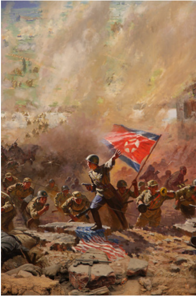
Figure 14. Painting of a wartime patriotic scene depicting the DPRK flag with the United States flag being maligned.