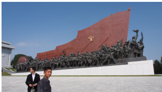
Figure 7. The Revolution Monument in Pyongyang.

proportionate and to give the meaning that all the workers and farmers should possess profound knowledge and raise their cultural standard so as to contribute to the building of a prosperous, civilized, independent, sovereign country.”