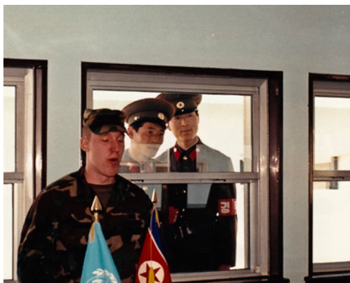
Figure 11. The armistice room in Panmunjom, DPRK/ROK, in 1990.

It is at the Joint Security Area at a place named Panmunjom—in a blue prefabricated building straddling the MDL—that one of the smallest, yet one of the most important DPRK flags, is located. It is a desk flag sitting beside a similarly-sized desk flag of the United Nations. Because the Republic of Korea (ROK), or South Korea, did not sign the armistice agreement, the UN flag rests there in its place. These two flags were as the result of intense negotiations over the size and disposition of the flags at the one place where both sides meet: the Joint Security Area. All aspects of the two flags—the height of the poles, the design of the flag’s bases, the finials, and the fringes—were the result of lengthy negotiations and visitors from both sides of the MDL are strictly warned not to touch either flag. (Figure 11)