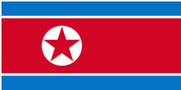
Figure 1. The National Flag of the Democratic People's Republic of Korea.

The Socialist Constitution of the Democratic People's Republic of Korea refers to the national flag in Chapter VII, Article 170: “The national flag of the Democratic People's Republic of Korea consists of a central red panel, bordered both above and below by a narrow white stripe and a broad blue stripe. The central red panel bears a five-pointed red star within a white circle near the hoist. The ratio of the width to the length is 1:2.” (Figure 1)