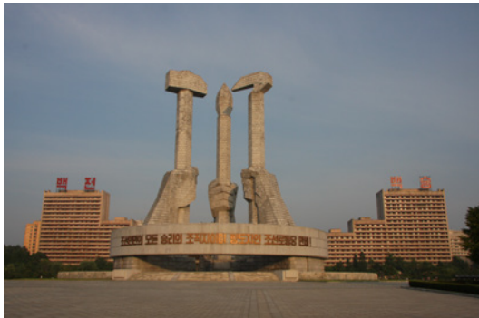
Figure 10. The monument to the founding of the WPK in Pyongyang.

A large number of the monuments in the city also utilize the National Flag and the WPK symbol as an integral part of their façades, reinforcing the equating of the love of the flag to the love of the country, and the WPK. (Figure 10)