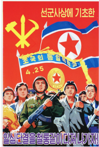
Figure 15. Patriotic postcard depicting DPRK flags.