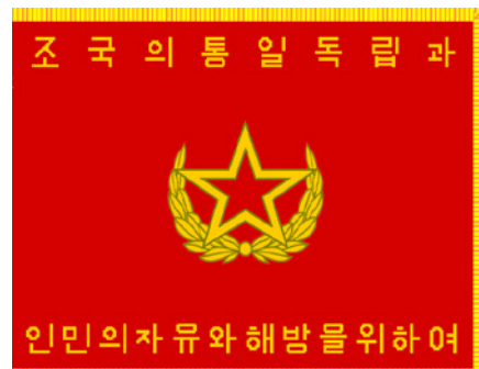
Figure 23. Obverse of the flag of the Worker-Peasant Red Guards.

The obverse of the Red Guards flag consists of a plain red background with the WPRG emblem—a wreathed, gold-outlined red star—placed in the center,