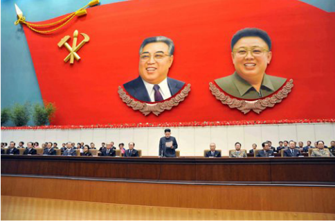
Figure 4. The Flag of the Workers' Party of Korea with the images of Kim Il-sung and Kim Jong-il.

However, there have been some variations in its design. One involved. This has involved reducing the size of the central emblem and placing it in the upper left corner of the flag, and the resulting larger red space used to place images of the leaders of the Party. Until 1994, it was the image of Kim Il-sung. After Kim Jong-il ascended to the Supreme Leadership of the WPK—and the DPRK—his image was added to the flag. (Figure 4)