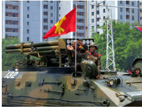
Figure 6. North Korean troops in an armored fighting vehicle flying the WPK flag during the Victory Day Parade, 2013.

The WPA emblem has been incorporated in the various military flags, seen at military parades, providing an unmistakable impression of the Korean People's Armed Forces as not only defenders of the country, but also of the party. (Figure 6)