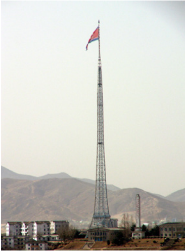
Figure 12. The flagpole at Kijong-dong, DPRK.

the Daesong-dong flagpole was extended in size to “top out” the Kijong-dong flagpole, DPRK authorities lengthened theirs in a tit-for-tat one-upmanship flagpole game (called “the Flagpole War”) that the South Koreans eventually gave up on. For a long time, the flagpole at Kijong-dong was the world’s tallest, until two giant-sized flagpoles were set up recently in Dushanbe, Tajikistan, and Baku, Azerbaijan. Still, the impressive height and lattice-work construction of the flagpole at Kijong-dong dominates the area. (Figure 12)