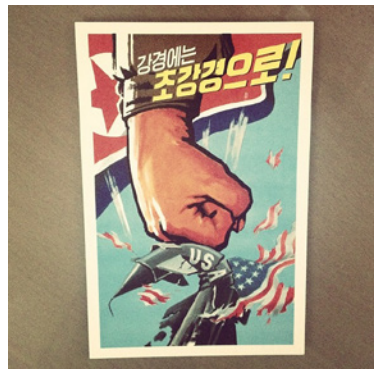
Figure 16. Patriotic artwork on a postcard depicting the DPRK flag and a tattered United States flag.

For displays of flags outside those of large parades, they are usually grouped together to create flag montages. It is not uncommon to see displays of the national flag, the WPK emblem, and the plain red flag of revolution, which also appears on monuments and more overt patriotic displays.