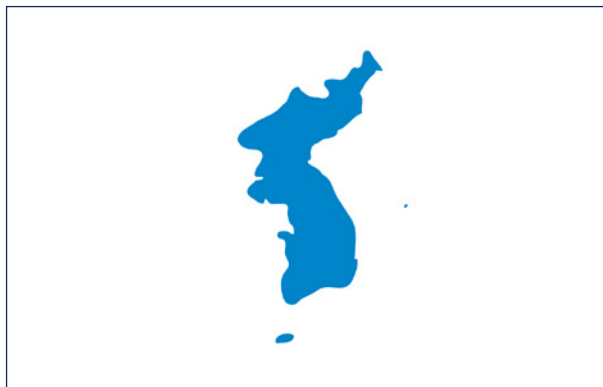
Figure 25. The Unification Flag of Korea.

The flag below—depicting the Korean Peninsula in blue on a white background—is used in sporting events where athletes from North and South Korea compete as one unified team. Carefully designed to reflect neutrality between both Koreas, it represents the desire of both sides for eventual reunification. (Figure 25)