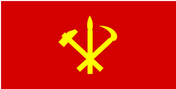
Figure 3. The flag of the Workers' Party of Korea.

The flag itself is a red banner with a ratio of 1:2 (like the national flag), and bears in the center of the flag a yellow emblem which is a combination of three tools: a hammer, a long-handled sickle, and a calligraphy brush: representing the country's workers, the country's farmers, and the country's intellectuals. Indeed, the brush is itself used as a symbol of the Juche philosophy in one of the dominant monuments in the DPRK capital. Merged together, the emblem and colors represent the united front of all social classes in one party. (Figure 3)