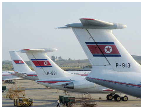
Figure 13. Koryo aircraft at Sunan International Airport, Pyongyang.

Patriotic artwork showing the DPRK is displayed everywhere. Some are in the form of traditional oil paintings (note the flag that the KPA officer is standing on). (Figure 14) Others come as postcards that entwine the flag with patriotic slogans and images of citizenry striving for a common goal. (Figures 15 and 16) Those pieces of patriotic artwork that involve other flags usually show those flags not getting accorded the same respect. It is not surprising that the United States flag is always depicted being dishonored in some way. (Figure 16)