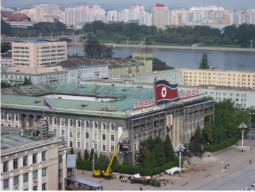
Figure 8. Government building in Pyongyang.