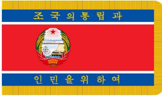
Figure 18. Flag of the Korean People's Armed Forces.

This flag is a variation of the national flag, with the state arms of the DPRK replacing the Juche star and disc. The Hangul inscription reads: “For the Independence of the Homeland and the People!” (Figure 18)