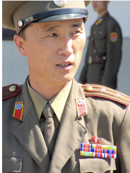
Figure 5. Flag-shaped lapel pin depicting Kim Il-sung and another worn on the lapel of the uniform of a member of the People's Army.