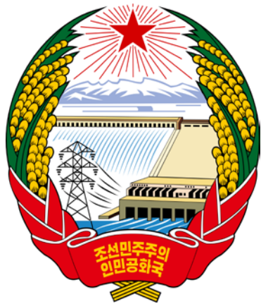
Figure 24. The state arms of the DPRK.

The state arms—clearly influenced by the arms of the USSR and its constituent republics—show the history of the country by the representation of Mount Paektu, the works of the country's workers, intellectuals, and farmers by the hydroelectric dam and ears of rice, and the guiding principle of the state by the red star of Juche socialism. The state arms predominates on official documents, on the facades of DPRK diplomatic missions, and on various flags. (Figure 24)