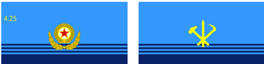
Figure 21. Obverse and reverse of the flag of the Korean People's Army Air Force.

The KPAAF flag—like the naval flag—is a design in which red does not predominate. Instead, light blue (representing the sky) shows clearly what branch of the armed forces this flag represents. A wreathed Juche star (though without a supporting lower wreath), and stylized wings makes up the emblem of the air force. Otherwise, the KPAAF date, mottoes (on some versions), and the WPK emblem layout follow the same pattern as that of the army and navy flags. Red is only shown in the central Juche star. (Figure 21)