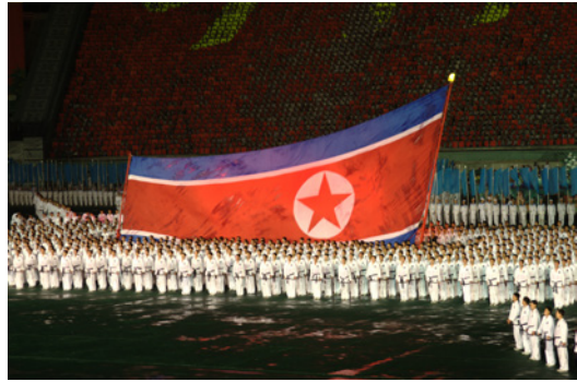
Figure 9. The DPRK flag paraded during the Arirang games, Pyongyang, in 2007.

A large number of the monuments in the city also utilize the National Flag and the WPK symbol as an integral part of their façades, reinforcing the equating of the love of the flag to the love of the country, and the WPK. (Figure 10)