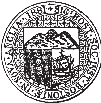
Seal of the Boston Society, showing an image of the Trimountain.

The city seal was created in 1823 and has no colors. Since the ordinance does not specifically define the flag, except to specify that the colors herein specified shall be the official colors of the city of Boston, namely: Continental blue and Continental buff (the colors derive from the uniforms of Boston soldiers during the Revolutionary War), the flag has been manufactured differently. One version has the seal in blue and white with the buff circle on